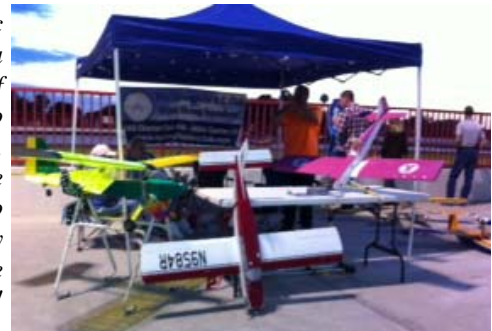
The static display had a variety of planes to check out, from the BCFO Star to floaters, they wowed the crowd!

land-locked planes and a couple floaters, along with the infamous BCFO-Star! Bryon's lit-up Senior caught a lot of attention!