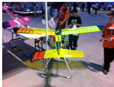
Bryon's rebuilt Senior was a great crowd-pleaser with its many lights and transparent covering. That should prove to be quite a sight in the air after dark! Great Job Guys!!

land-locked planes and a couple floaters, along with the infamous BCFO-Star! Bryon's lit-up Senior caught a lot of attention!