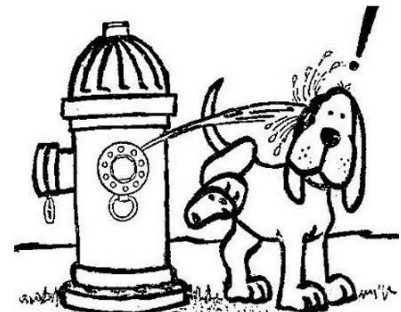
HAVE YOU EVER HAD ONE OF THOSE DAYS WHEN NOTHING WENT RIGHT!